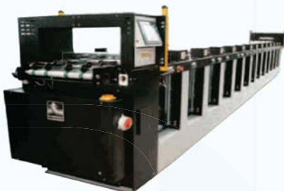
Ultra High Volume