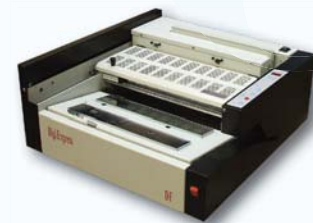
DigiExpress/DigiPro User-friendly, economical solution for total on-demand perfect binding. DigiPro has Hard Cover capabilities.