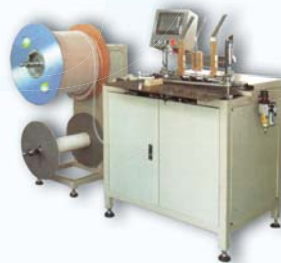
Heavy Duty Series Wire and metal coil equipment for binderies and large printers