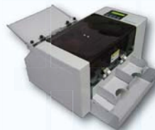
GC Series Multifunctioning slitters, that are ideal for on-demand environments

Digital Finishing Group 1260 Kempar Madison Heights, MI 48071 800.480.4DFG fax: 775.587.5352 www.dfgus.com