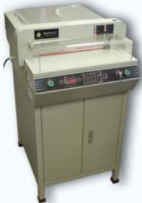
DigiCut Series Automatic electric paper cutters